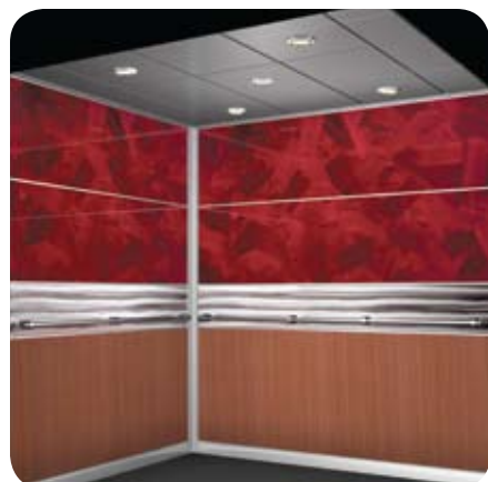
EL300 Horizontal panels Accent panels above the handrail other material options below