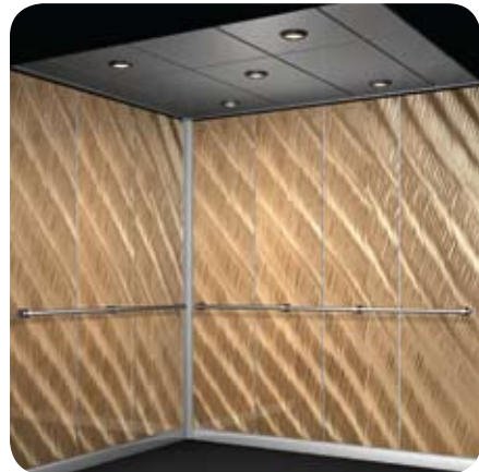
EL100 Vertical panels Reveals or seams

Shown below are three available options for the ease of your specification. Custom options are also available.