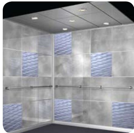
EL200 Square panels Maximum versatility for accents