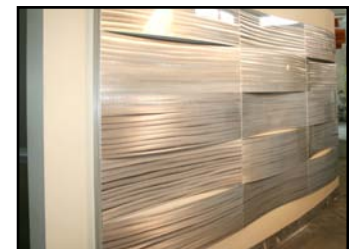
6 After all panels are snapped in assembly is complete.

For complete technical information, detailed drawings, installation information or other technical information, please call (510) 632-0853 or visit mozdesigns.com/spec_library.html .