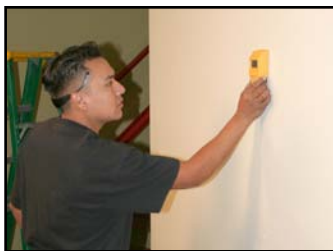
1 Using stud finder examine substrate and check for studs.