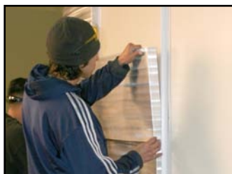
5 Position and snap panels into the Snap Bars starting with one corner.