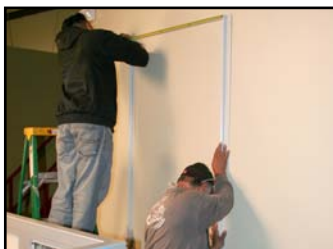
4 Anchor first Snap Bar and set second Bar parallel to the first and so on with the remaining Sanp Bars.