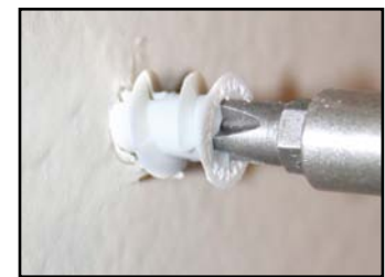
3 Set drywall anchor for screws if needed.